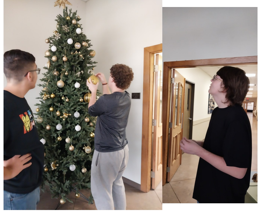
We want to say a special thank you to the youth. While getting pies baked and ready to hand out, they decorated the Christmas tree at the Deen Building for us. Thank you all so much!